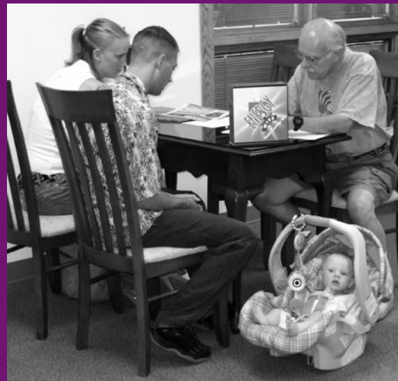
A Weld County family talks to a volunteer of Faith Community Service Fund in Greeley about the energy saving kit.

Thousands of limited income families in Colorado are receiving free energy saving kits for their homes through a new Energy Outreach Colorado program funded by the Governor's Energy Office.