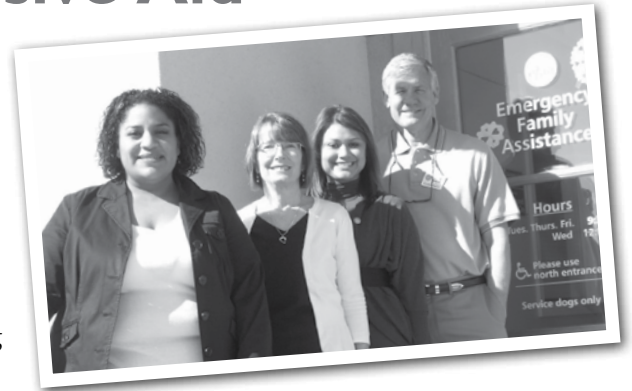
The staff at Emergency Family Assistance Association in Boulder.

Emergency Family Assistance Association (EFAA) of Boulder has partnered with Energy Outreach Colorado to help low-income families and individuals stay warm and safe in their homes since 1994, when EOC first began providing energy assistance funds to local nonprofits.