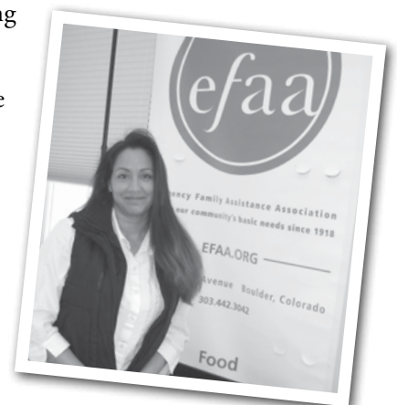
Energy assistance helped this EFAA client through a job layoff.

For more information about Emergency Family Assistance Association, go to www.efaa.org or call 303-442-3042.