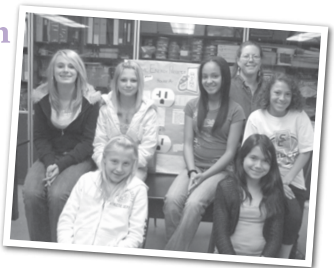
Energy Investigation Team from Challenger Middle School in Colorado Springs.

"I learned how to save energy in my home by not using as much water," said one Challenger Middle School student. Another said, "We now use more